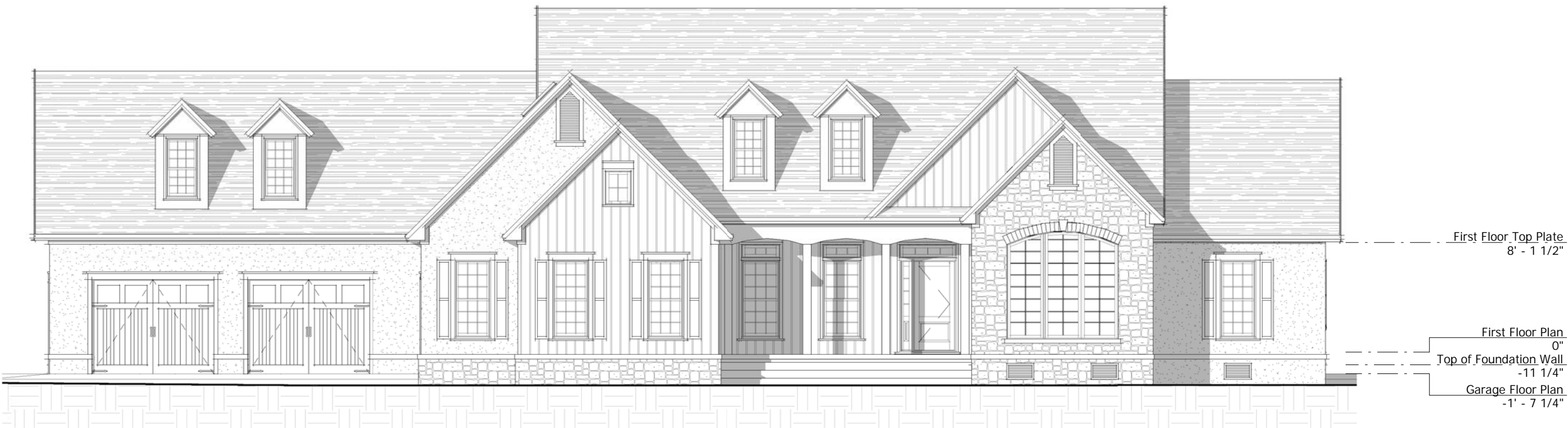
1 South Elevation 1/8" = 1'-0"