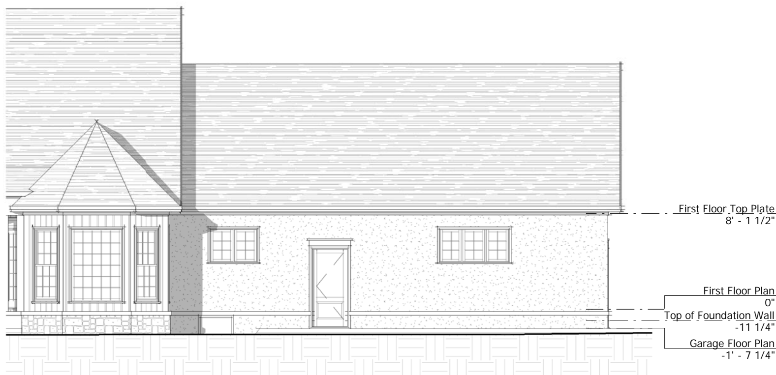
3 North Elevation 1/8" = 1'-0"