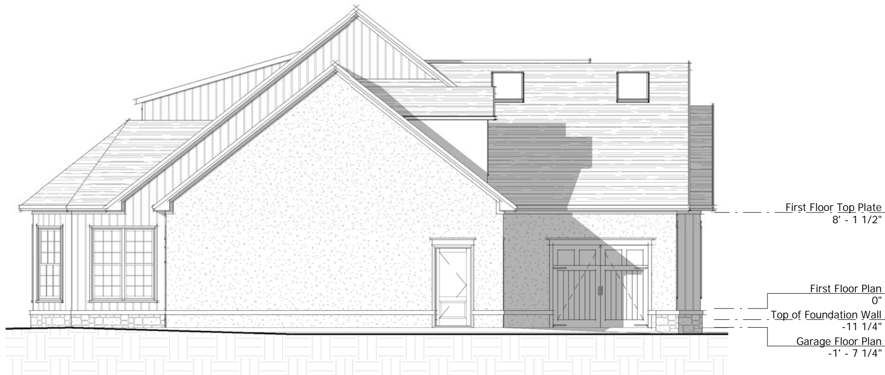
2 West Elevation 1/8" = 1'-0"