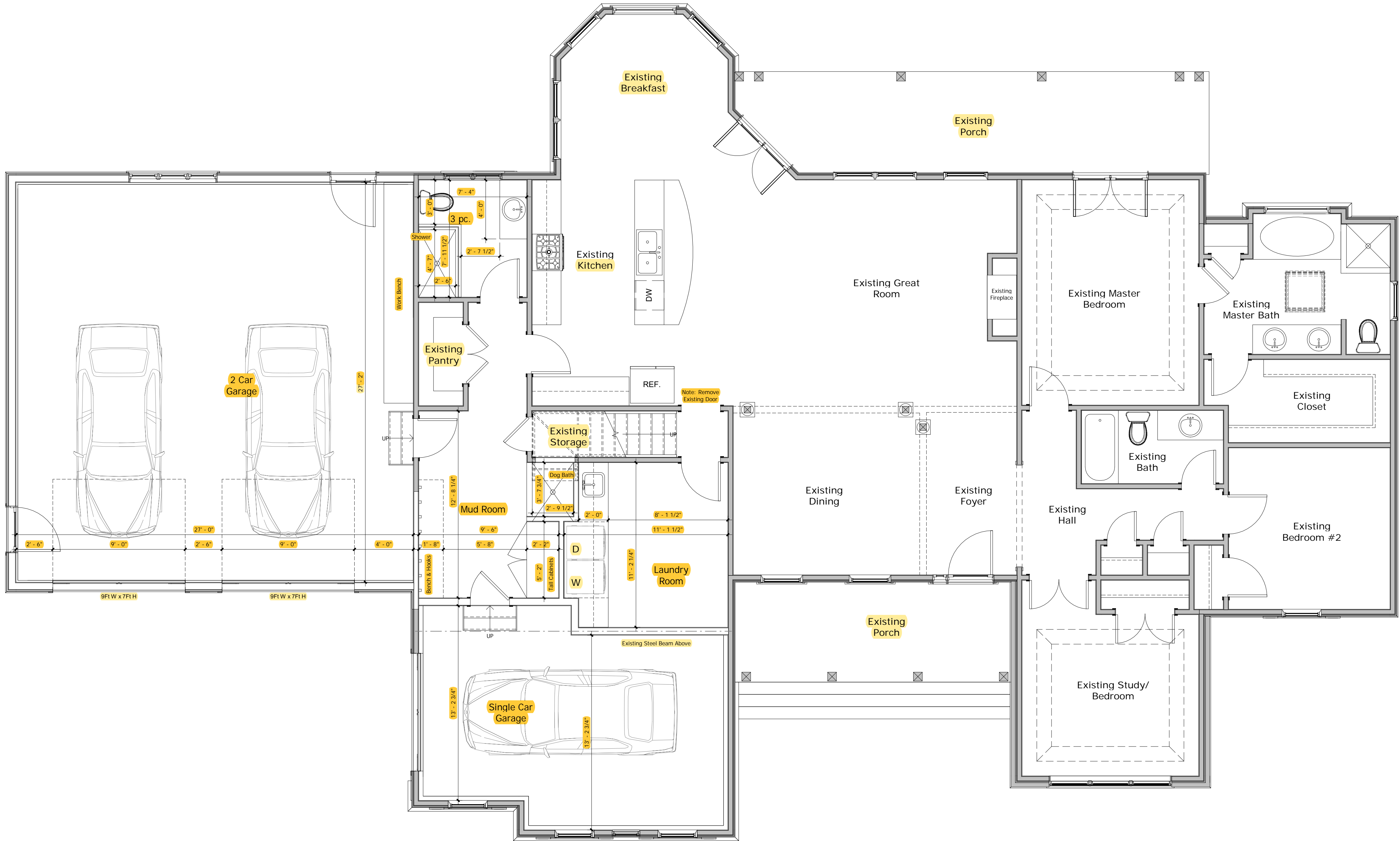
1 First Floor Plan A2 1/4" = 1'-0"